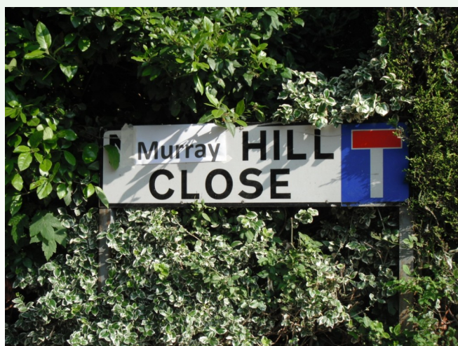
Murray mania in Maryhill Close. July 7th 2013

Thank you for your patience whilst the work was being carried out.