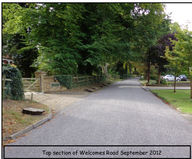
Top section of Welcomes Road September 2012

It is appreciated that a lot of gravel has built up on the edges and is compacted with bitumen binder. The issue of clearing this material has yet to be resolved and is subject to the advice of the solicitor handling the case against Arnold Tarmac Ltd. At some point however it will need to be cleared though at whose expense is not clear at this stage of proceedings. In theory Arnold Tarmac who created the nuisance should be paying for it.